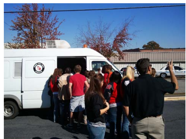
Students receiving a visual demonstration of the Georgia Rural Water Association Sewer Video Van

Lunch was provided by Robins Federal Credit Union.