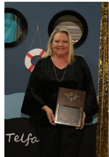
C.J.'s Flowers & Gifts 2019 Telfair County Business of the Year