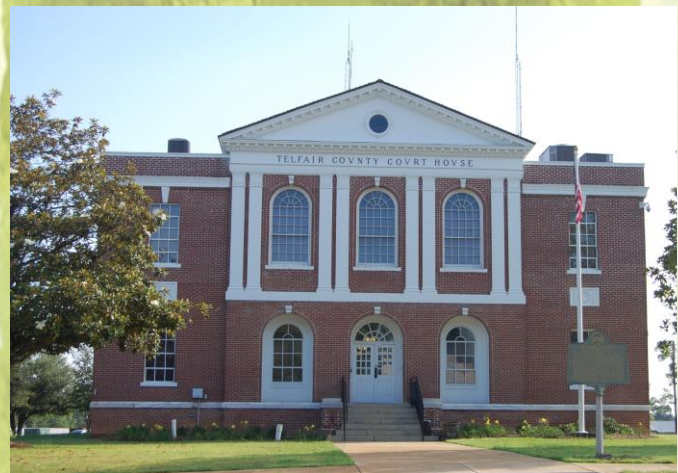
Telfair County Courthouse McRae, GA

Telfair County Chamber of Commerce 9 East Oak Street * McRae, GA 31055 Office (229) 868-6365 * Cell (229) 860-0203 * Fax (229) 868-7970 rogers@telfairco.org * www.telfairco.org