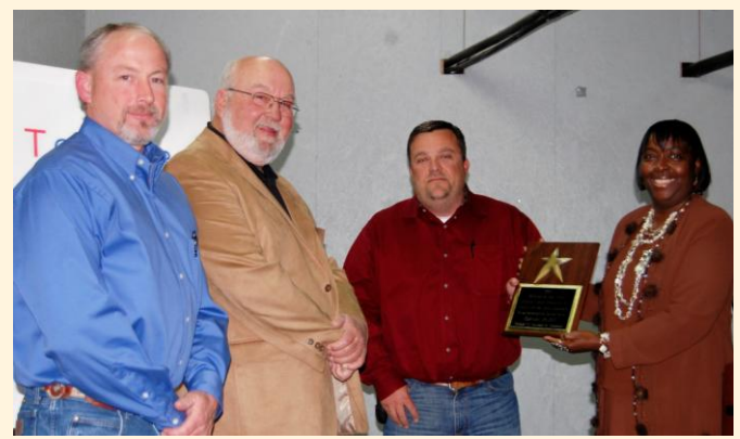
Telfair Forest Products Business of the Year