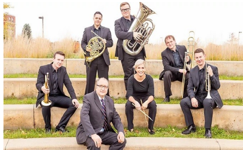
(continued from page 1)