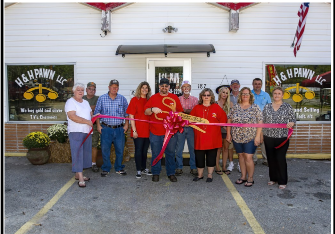
Ribbon donated by C.J.'s Flowers & Gifts

A Ribbon Cutting and Grand Opening Ceremony was held on Friday, September 27, 2019 for H&H Pawn., LLC. They are located at 187 S. Third Ave., McRae-Helena, GA.